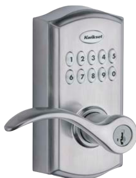
99550-001 Satin Chrome 26D