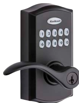
99550-004 Matte Black 514

FINISH AND LIFETIME WARRANTY MECHANICAL THREE YEAR ELECTRONIC WARRANTY