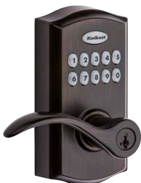
99550-003 Venetian Bronze 11P