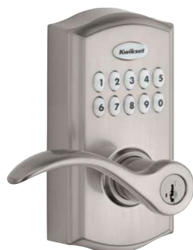
99550-002 Satin Nickel 15