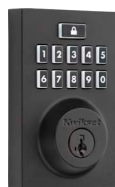
99130-011 Matte Black 514 913 CNT 514

FINISH AND LIFETIME WARRANTY MECHANICAL ONE YEAR ELECTRONIC WARRANTY UN AÑO DE GARANTÍA EN COMPONENTES ELECTRONICOS