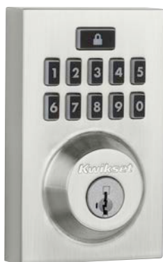
99130-008 Satin Nickel 15 913 CNT 15