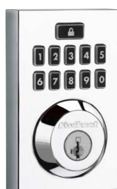
99130-010 Polished Chrome 26 913 CNT 26