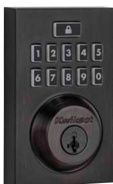
99130-009 Venetian Bronze 11P 913 CNT 11P