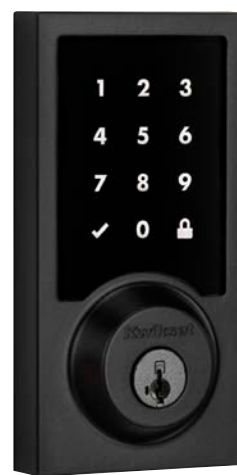
99160-028 916CNT ZW500 514 RALFD Matte Black 514

FINISH AND LIFETIME WARRANTY MECHANICAL ONE YEAR ELECTRONIC WARRANTY