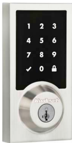
99160-016 916CNT ZW500 15 RALFD Satin Nickel 15