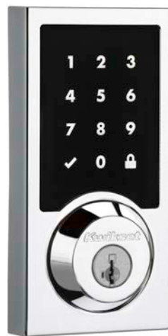
99160-018 916CNT ZW500 26 RALFD Polished Chrome L03