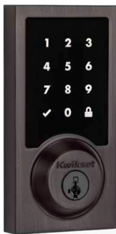
99160-017 916CNT ZW500 11P RALFD Venetian Bronze 11P